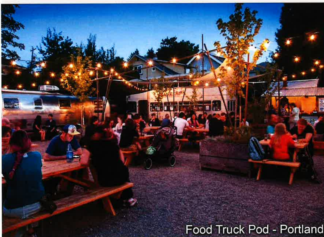
Food Truck Pod - Portland

activate a rarely used city-owned space in the heart of the west end that brings instant energy and regional exposure. goal: creative space. community space. open-air art gallery. food trucks. outdoor entertainment. incubator of artist culture. art market. events