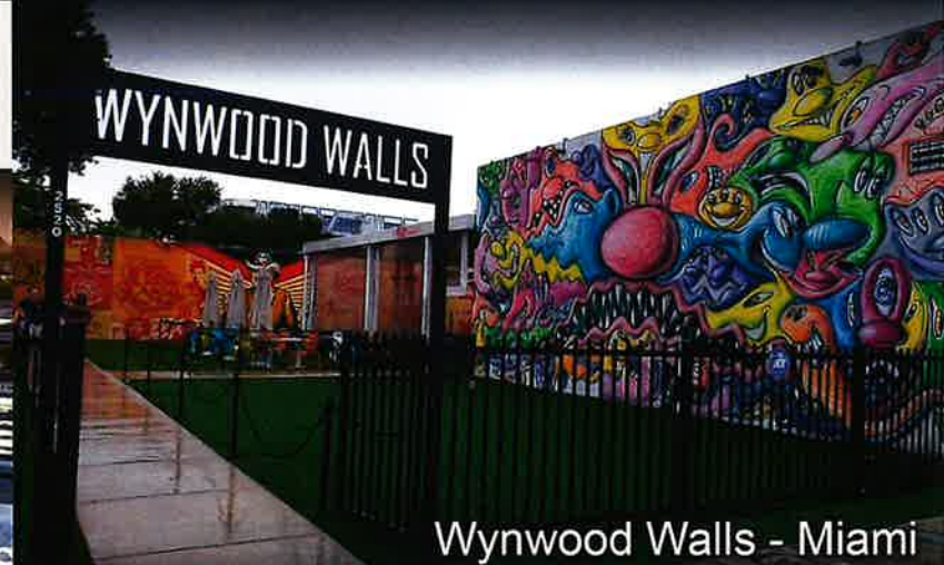
Wynwood Walls - Miami