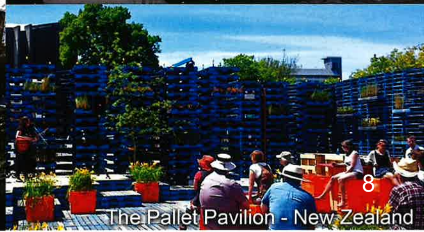
The Pallet Pavilion - New Zealand