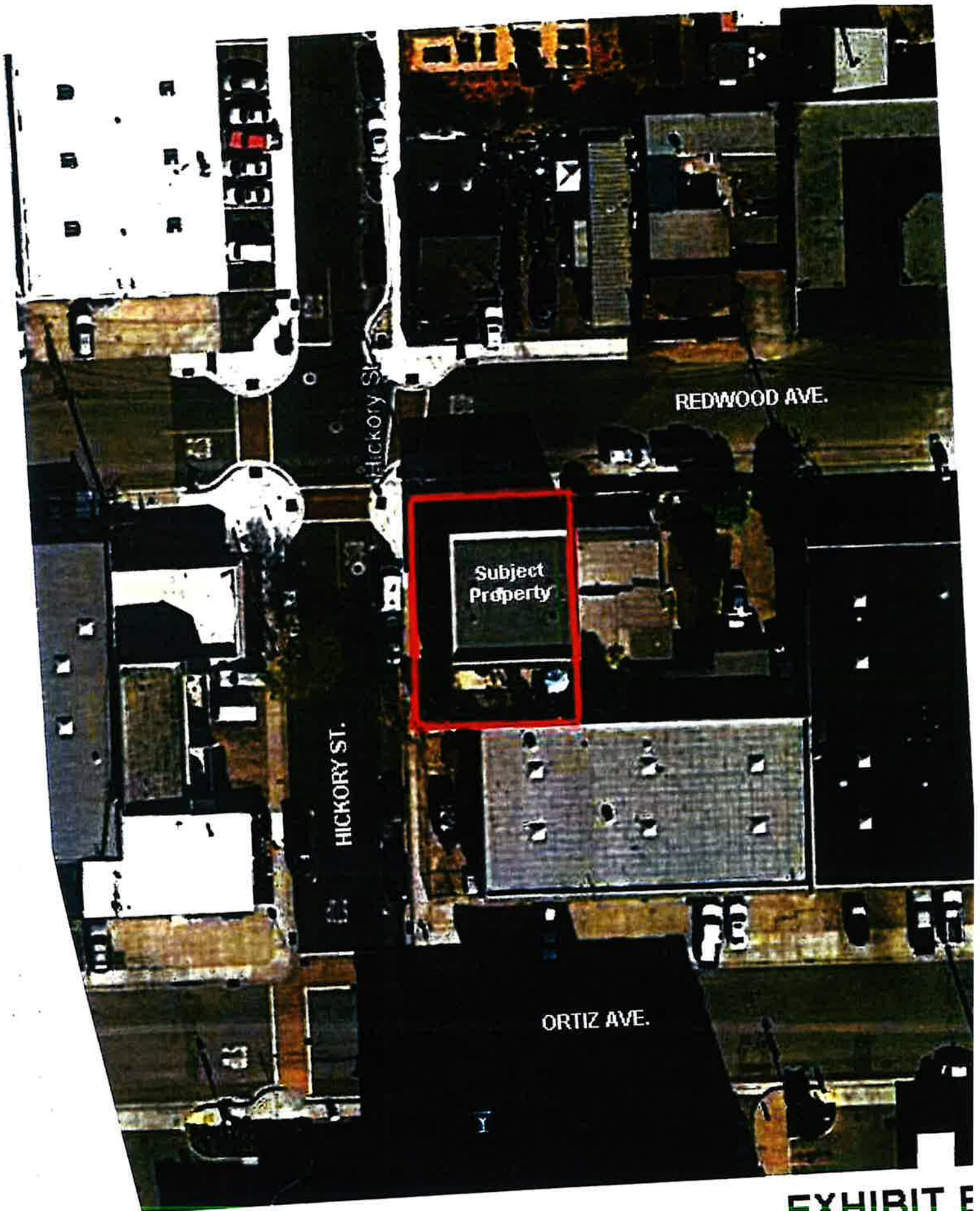
Aerial Photo