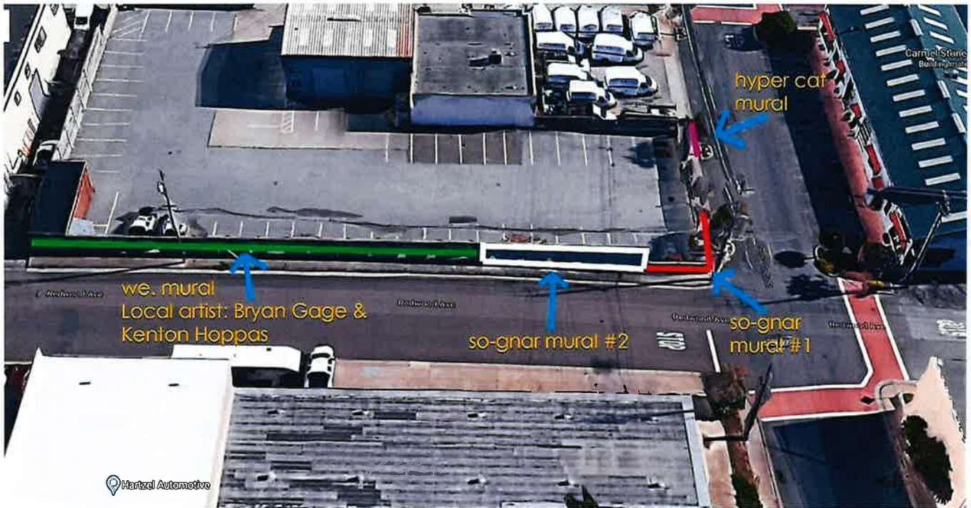
Exhibit A Mural Location